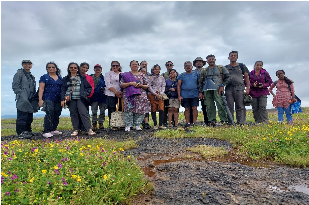
Group photograph clicked during a field camp at Kass Plateau, Satara, Maharashtra, October 2023

BNHS CEC is happy to announce the admissions for Basic Course in Botany for the year 2024. The course includes inaugural and wrap-up sessions, field visits around Mumbai and two field camps to any floral habitat across India.