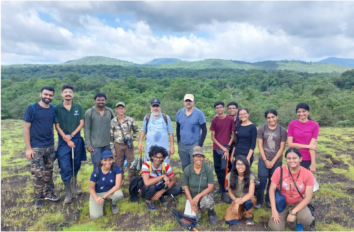
Group photograph of participants of Basic course in Herpetology batch 2023-24 during Goa field camp in 2023

BNHS CEC is happy to announce the admissions for Basic Course in Herpetology (study of reptiles and amphibians) for the year 2024. The course includes inaugural and wrap-up sessions, field visits in and around Mumbai and field camps to various habitats across India.