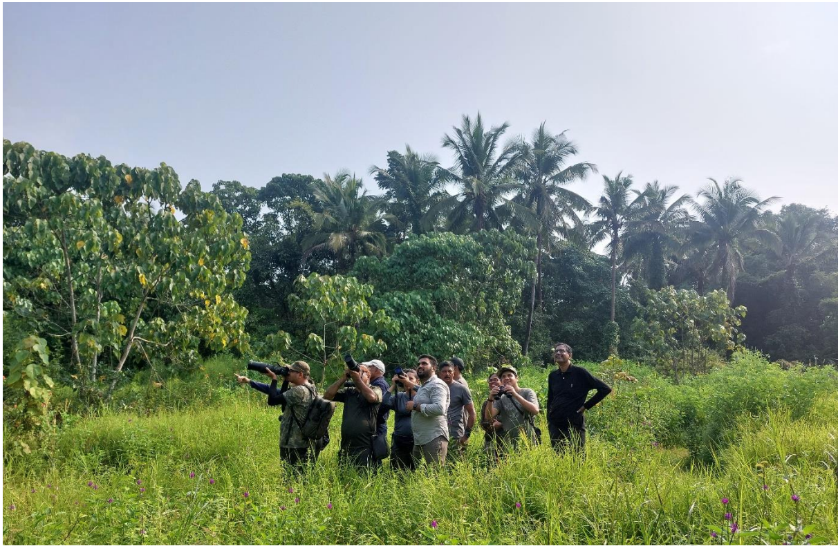
Participants of Basic Course in Butterfly Studies batch 2023-24 during field camp at Belvai, Karnataka.

BNHS CEC is happy to announce the admissions for Basic Course in Butterfly Studies (Butterfly Course) for the year 2024-2025. The course includes inaugural and wrap-up sessions, field visits around Mumbai and field camps to various butterfly habitats across India.