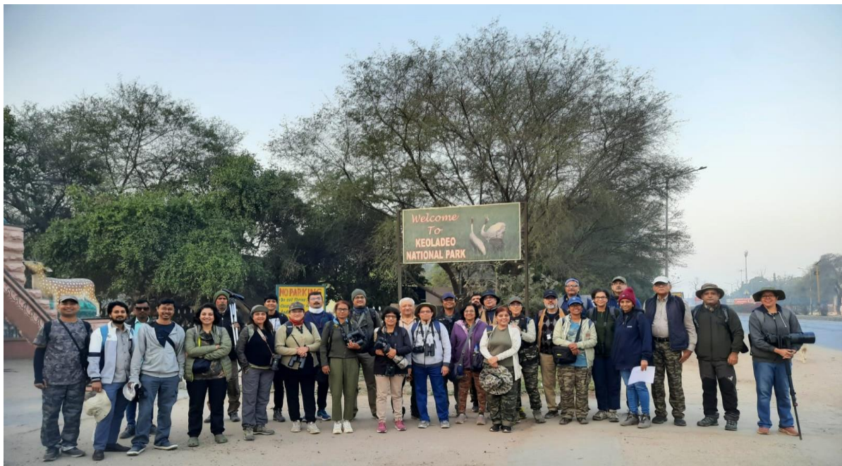
Group photograph of participants of Leadership Course in Biodiversity Conservation during field camp March 2024 at Bharatpur, Rajasthan.

BNHS CEC is happy to announce the admissions for 'Leadership Course in Biodiversity Conservation' (Lead Bio) for the year 2024-25. The course includes inaugural and wrap-up sessions, field visits in and round Mumbai and field camps to various wildlife habitats across India.