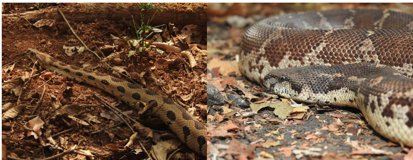
Russell's Viper and Common Sand Boa clicked by CEC coordinator during field camp and visits for Basic Course in Herpetology.