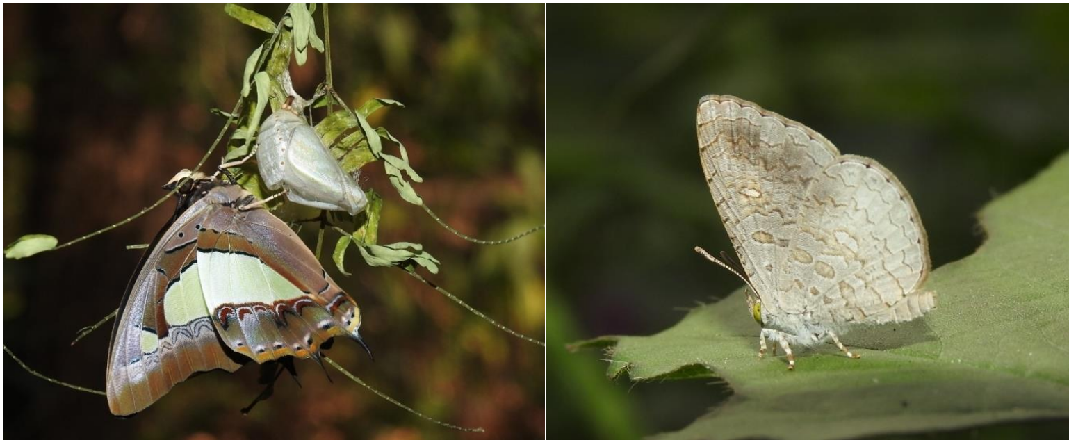
Black Rajah and Apefly clicked by coordinator during field visits and camps during the Basic Course in Butterfly Studies 2023