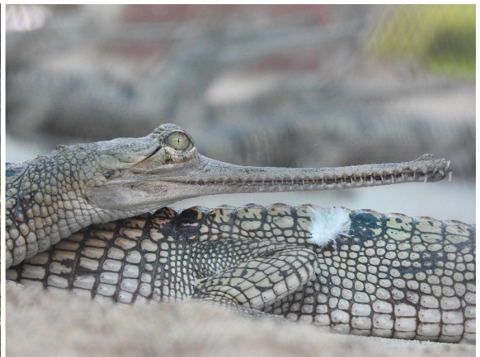
Bar Headed Geese and Gharial (Gharial Centre, Morena Chambal) clicked by CEC Coordinator during field camp for Leadership course in Biodiversity Conservation