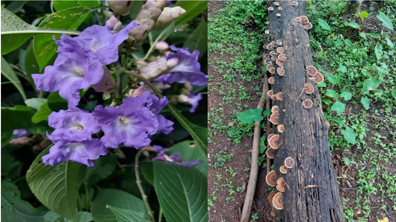
Strobilanthes callosa and Bracket fungi clicked during field visit