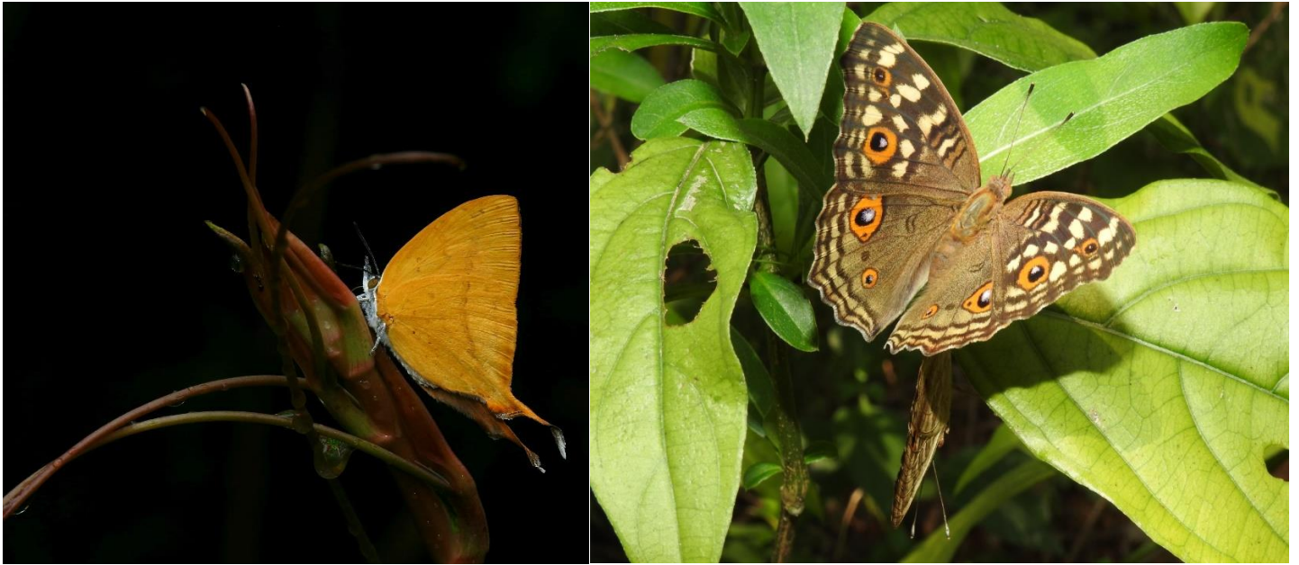
Yamfly and Lemon Pansy during field visit at CEC, Goregaon

Some images clicked during the field visits and camps of the course: