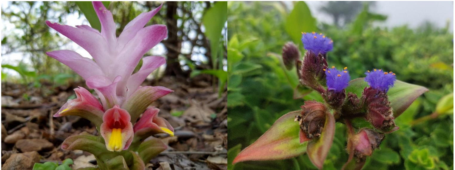
Curcuma pseudomontana and Cyanotis tuberosa clicked during a field visit of Botany Course