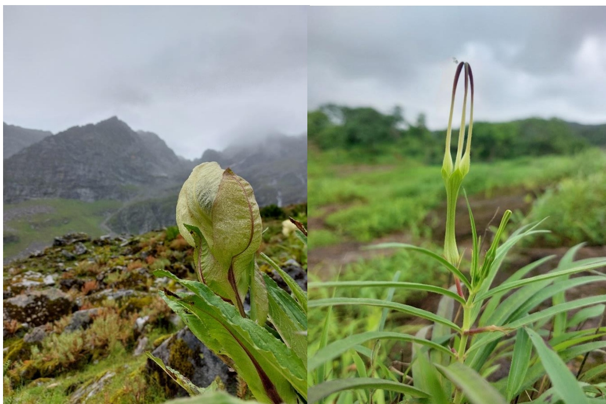
Saussurea obvallata (Field camp - Uttarakhand) & Ceropegia attenuate (Field visit - Mumbai)

Some images clicked during the field visits and camps of the course: