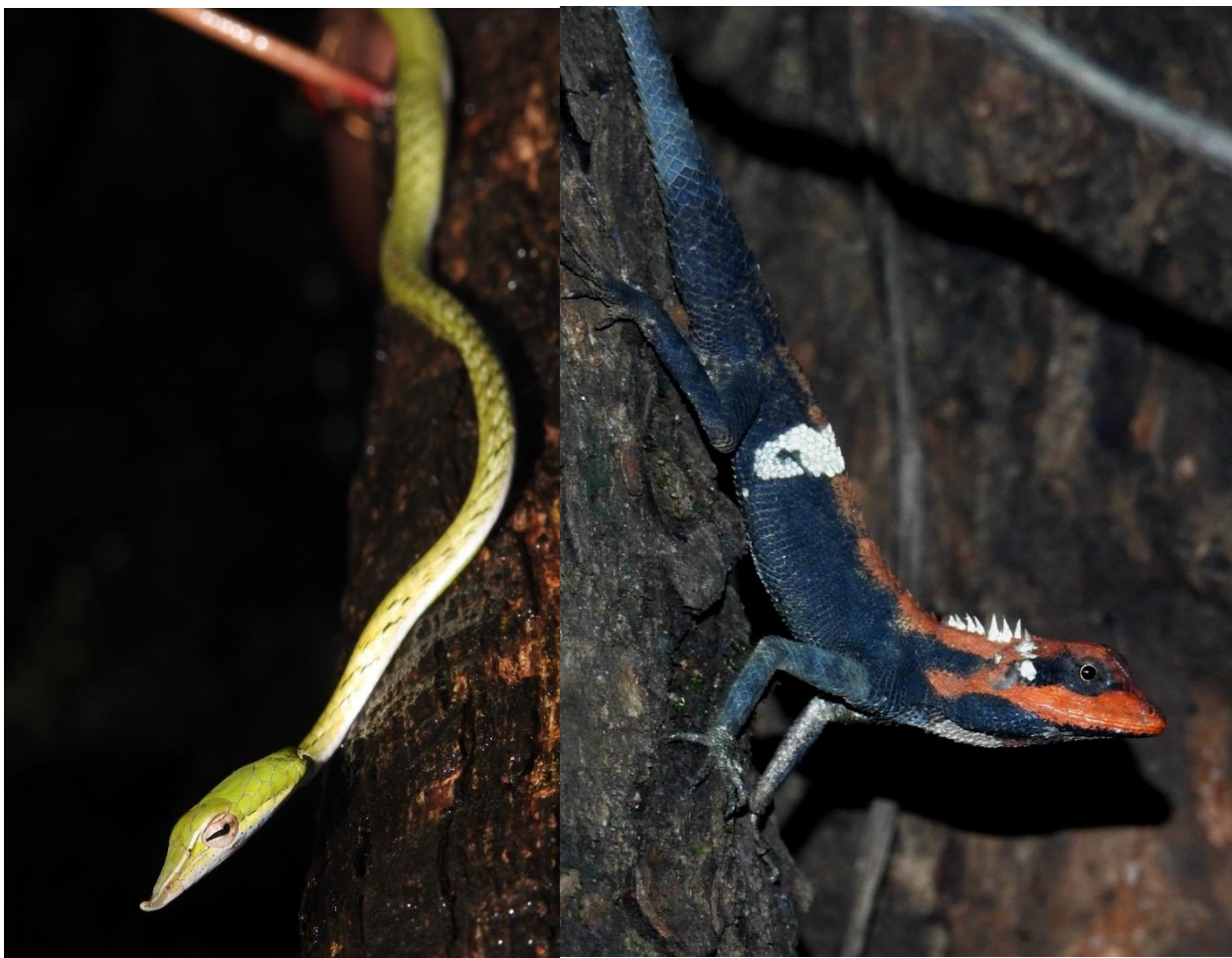
Common Vine Snake and Forest Calotes clicked by CEC coordinator during field visit and camps of Basic Course in Herpetology 2023

Some images clicked during the field visits and camps of the course: