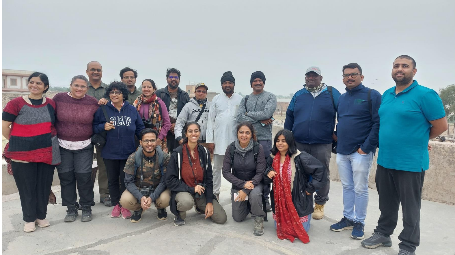
Group photograph of participants of Basic Course in Ornithology during field camp at Desert National Park, (BNHS Khichan field station) in 2024

BNHS CEC is happy to announce the admissions for Basic Course in Ornithology (BCO) for the year 2024-2025. The course includes inaugural and wrap-up sessions, field visits in and around Mumbai and field camps to various bird habitats across India.