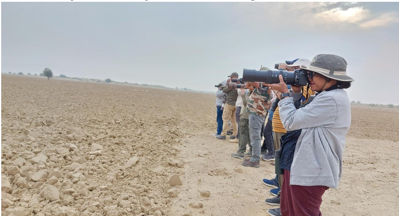
Basic Course in Ornithology Batch 2023-24 field camp at Desert National Park, Rajasthan

Some images clicked during the field visits and camps of the course: