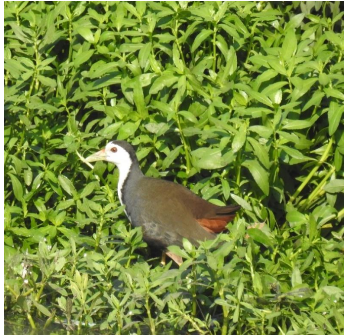
Bamboo Pit Viper and White-breasted Waterhen by CEC Coordinator clicked during field camp and field visit for Leadership course in Biodiversity Conservation